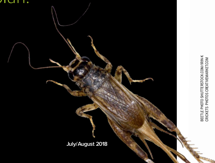
BEELE PHOTO SHUTTERSTOCK.COM/IRINK CRICKETS PHOTOS CREATIVE MARKET.COM